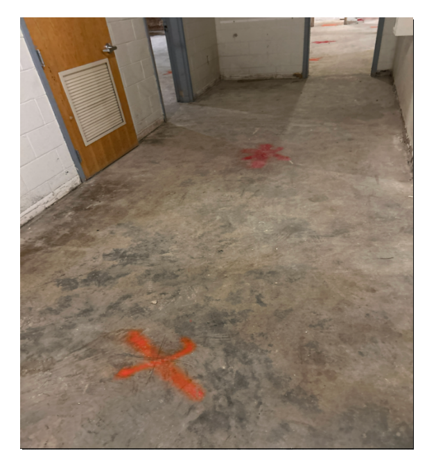
Begin interior light fixture layouts throughout